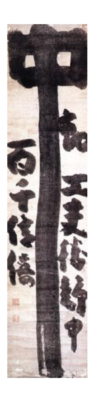
"Midst" - Hakuin's final calligraphy, executed close to death. The dynamic 1.4m-long brush-stroke gives force to his words: 'Meditation in the midst of activity is a hundred thousand times better than meditation in stillness.'